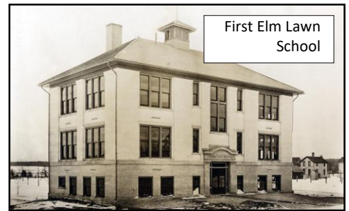
First Elm Lawn School

1918 building during the mid to late 1940s and a building constructed in 1949 still serves as part of the current school. More additions and renovations occurred in the mid to late 1960s and a major addition in 1980 not only expanded the facility but also marked the demolition of the 1918 structure. After two failed referendums to build a second high school, the Middleton Fire Company agreed to give a portion of the adjoining Firemen's park, so the high school could expand, and the District would remain with one high school. During 2001-2003, additional high school expansion occurred, leading to room for 2,000 students.