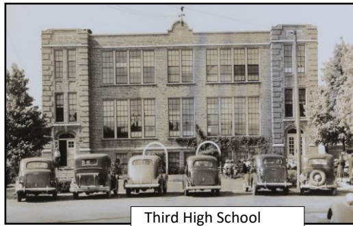
Third High School

helped to accommodate Middleton's growing population. However, the rapid growth necessitated a major change ... an entirely new elementary facility, known as Sauk Trail School, built on Branch Street in 1953.