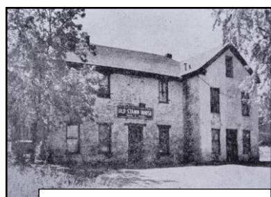
Early photo of Old Stamm House

The Pheasant Branch Hotel and Tavern (present day Stamm House, 6625 Century Ave., No. 3 on map ) was built in 1847 and first served as a store. It often stocked provisions needed by local residents and travelers, and for a time contained the Post Office for Pheasant Branch. Prior to the Civil War it supposedly served as a station on the "Underground Railroad," offering refuge to former slaves seeking freedom in the North. The Pheasant Branch Brewery was built nearby alongside the creek.