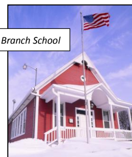
VFW - Pheasant Branch School